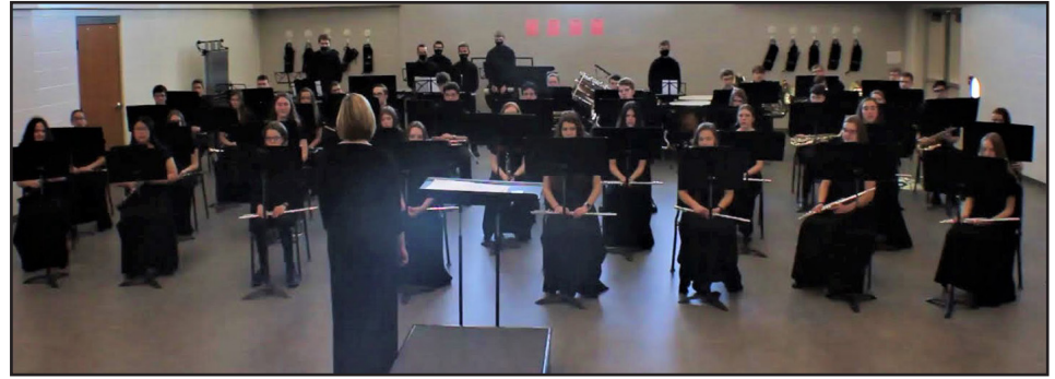
Valley Lutheran’s Symphonic Band participated in the Band and Orchestra Festival virtually by recording their pieces on March 12th.

masks as much as possible, and the necessary distancing makes it more difficult to hear each other. Among the biggest disappointments for the musicians has been the cancellation of concerts and the annual Lenten tour, and the suspension of extra-curricular music groups.